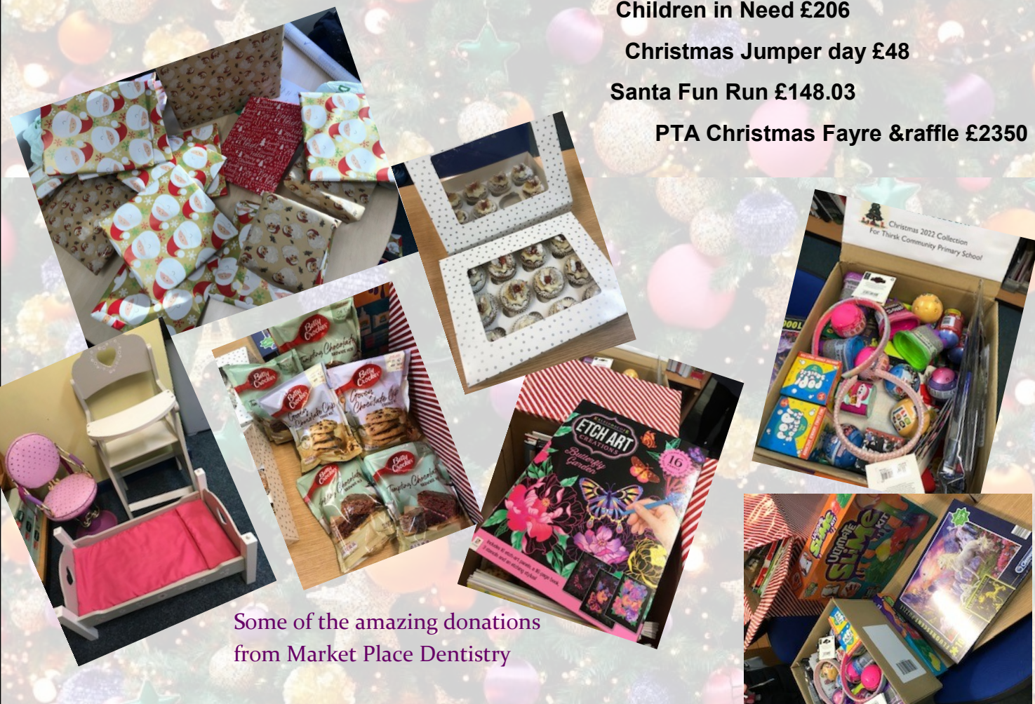
Some of the amazing donations from Market Place Dentistry